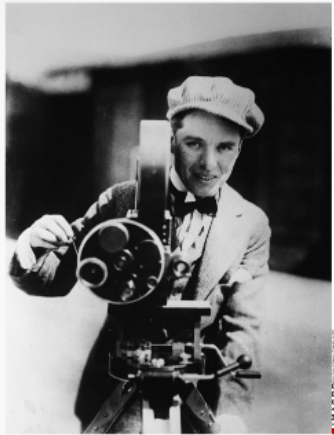
Charlie Chaplin as a director, c. 1925