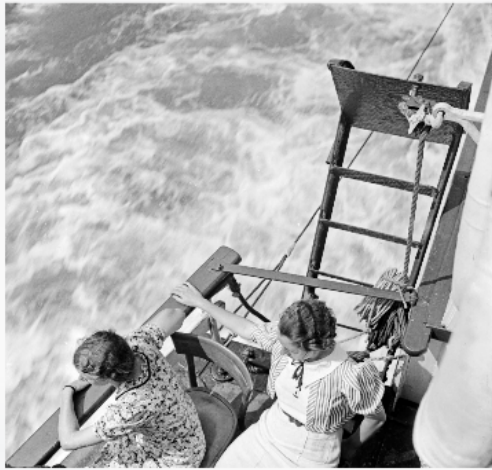
The Köln Düsseldorf on the Rhine, 1930s