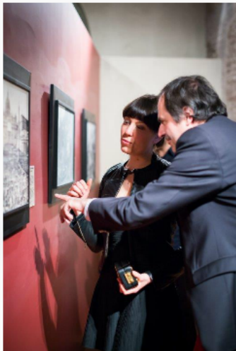
All Our Yesterdays - Pisa 2014

With these assets, PHOTOCONSORTIUM is able to provide to its members the following services: