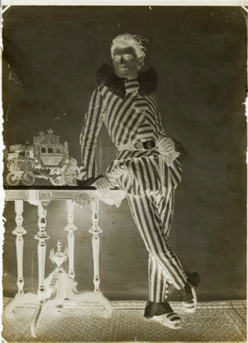
Photographic study of a young man dressed as a harlequin, c. 1901-1925