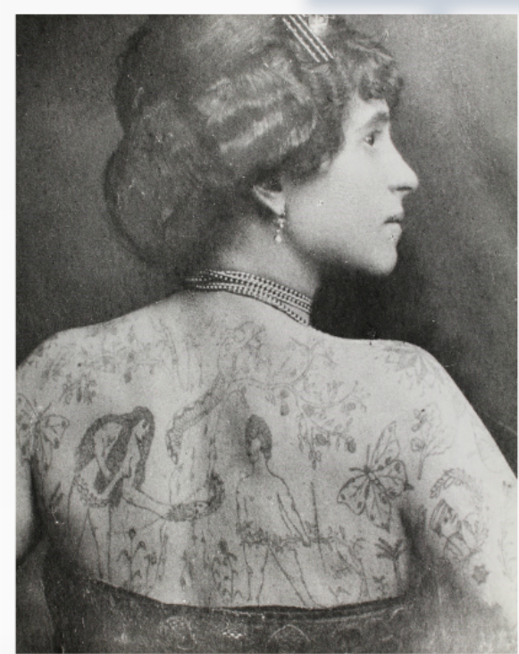
Tattooed woman photographed from the back by Wilhelm Burger, Vienna, c. 1880 ©IMAGNO (Austria)

By not only welcoming applications of interested parties, but also proactively establishing contact with interesting members, partners or networks, PHOTOCONSORTIUM aims at expanding its current capacity, service range, strength and relevance. Furthermore, the association most warmly encourages collaborations or partnerships with other professionals from its action radius, in order to develop new expertise from fresh synergies, and create innovative applications/processes/techniques by combination of specialisms.