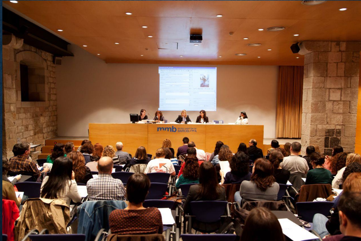
II Conference on Photography in Museums and Archives. Photography documentation in museums . Museu Marítim de Barcelona, 30 May 2013