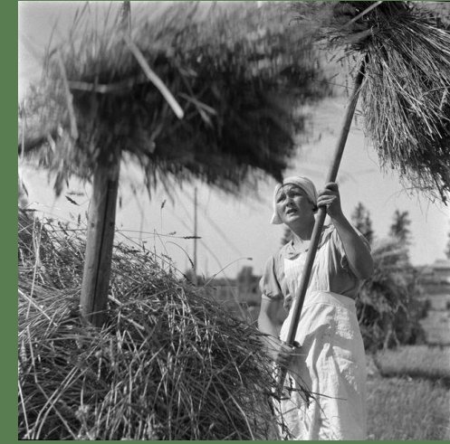
Photographs: Neittamo or Heinrich Iffland, "Superman" Paavo Nurmi, 1925 / Unknown, "Fair weather for haymaking"