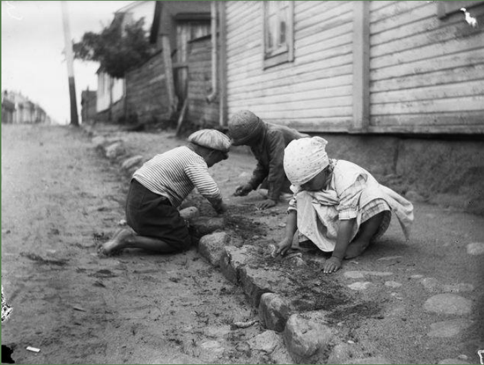
Children cleaning the curb in Saaristokatu, Raahen, in 1923