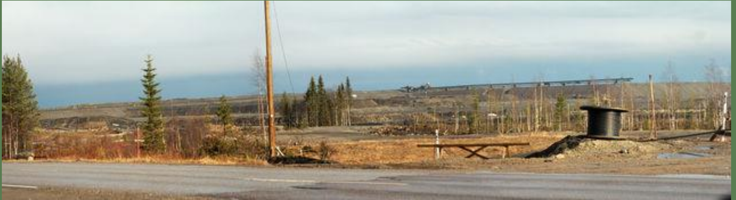
The riches of the "Hunger Country", Talvivaara mine in Sotkamo, 2013