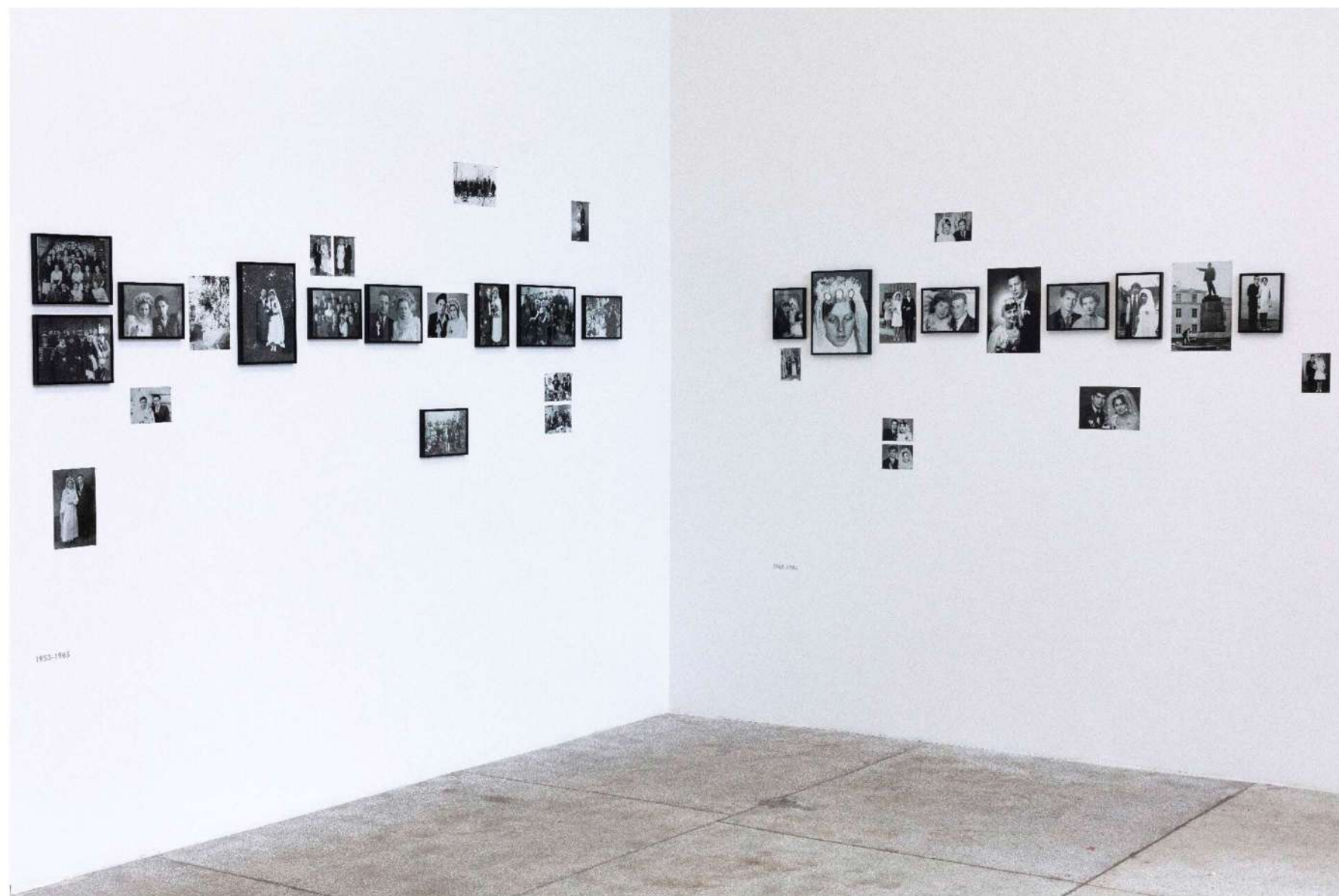
Fragment of the exhibition "Dziavočy wiečar". FAF Gallery (Warsaw, Poland) 2019