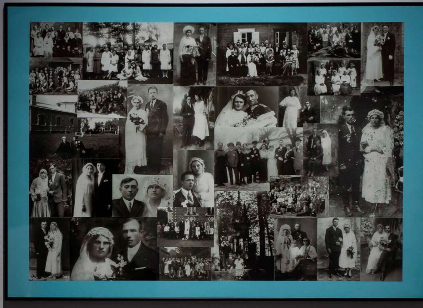
Fragment of the exhibition Tam gdzie Teraz. Galeria Labirynt (Lublin, Poland) 2019