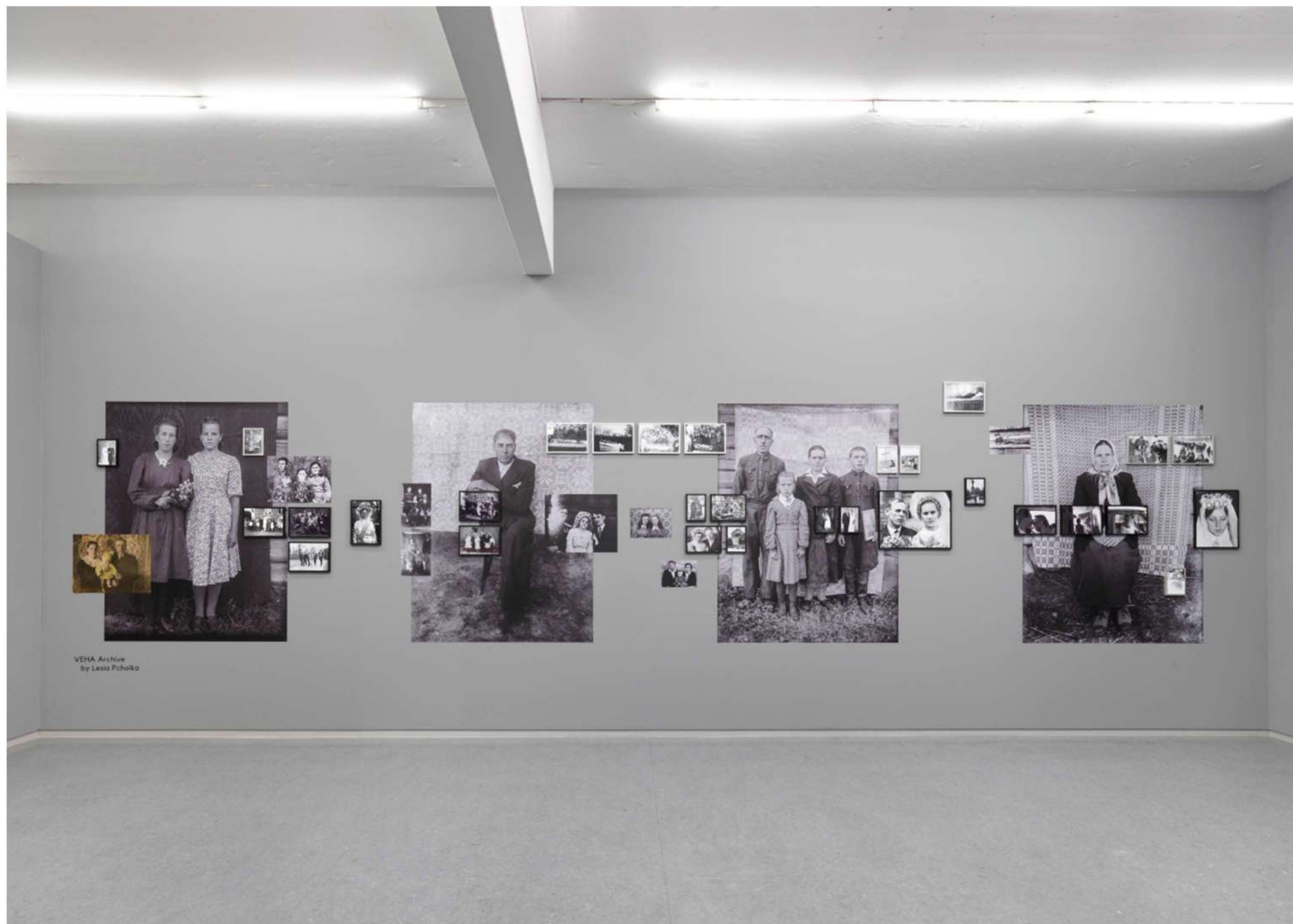
UPCOMING. Belarusian female artists. Dialog between the generations. Gallery KVOST (Berlin, Germany) 2022